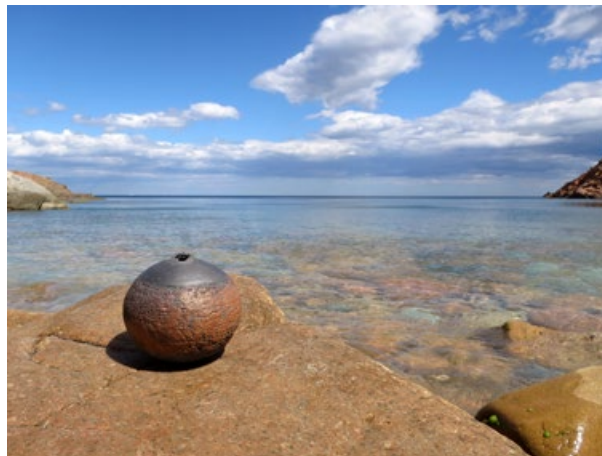
Castaway • Whispering Globe wheel-thrown, glaze • raku • Ø 11 cm