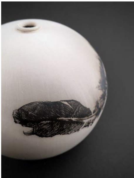
Simple is Beautiful • Whispering Globe wheel-thrown • raku • Ø 12 cm