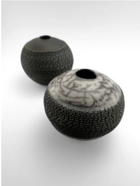
Opposites Attract • Whispering Globes wheel-thrown • raku • Ø 8–12 cm