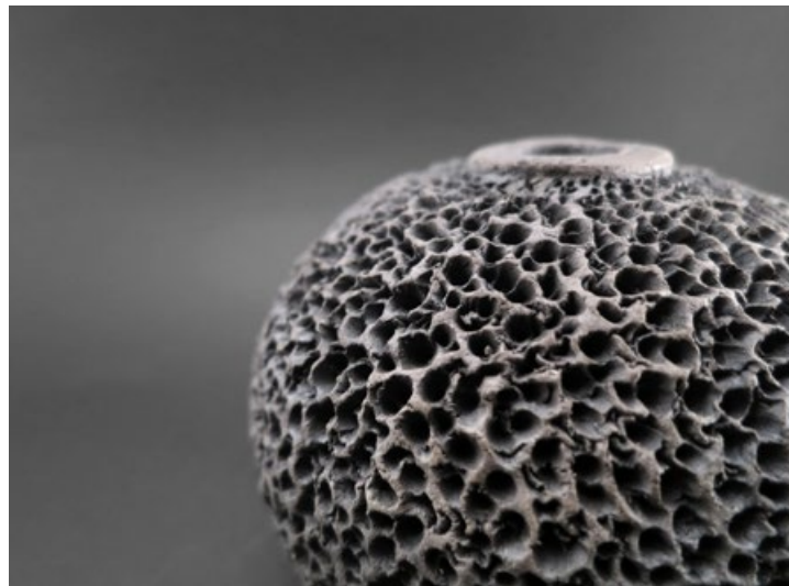
Black Sponge • Whispering Globe wheel-thrown, deformed • raku • Ø 12 cm