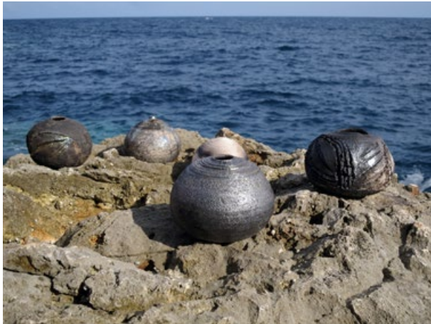
Relic • Whispering Globe wheel-thrown, glaze • raku • Ø 14 cm

The Salento Series was born during the 1st Ceramic Symposium in Salento and Raku Workshop at Bottega Branca, Tricase, where – truly fascinated by the beauty of the place, local landscapes and people – I had the chance to create Whispering Globes. I intended to incorporate all the surrounding natural beauties of Salento in my globes.