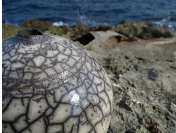
Fractured But Whole • Whispering Globe wheel-thrown, glaze • raku • Ø 13 cm

The Salento Series was born during the 1st Ceramic Symposium in Salento and Raku Workshop at Bottega Branca, Tricase, where – truly fascinated by the beauty of the place, local landscapes and people – I had the chance to create Whispering Globes. I intended to incorporate all the surrounding natural beauties of Salento in my globes.