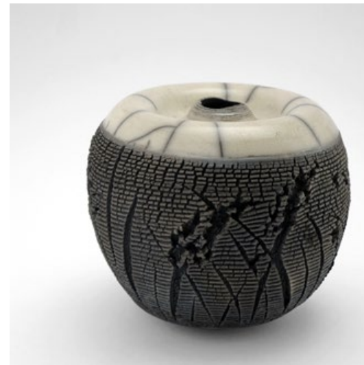
Reanimation • Whispering Globe wheel-thrown • raku • Ø 12 cm

My personal aim is to create lovable, usable, high-quality objects that provide a wide range of visual and tactile experiences , objects that can decorate both 21st century homes and public spaces.