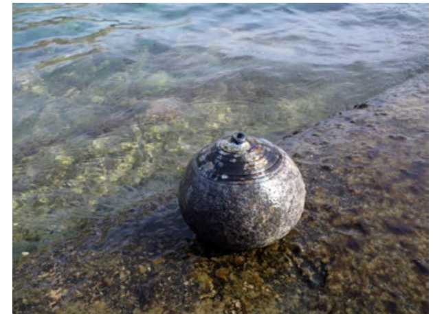
Dancing Sunlight • Whispering Globe wheel-thrown, oxides, glaze • raku • Ø 12 cm