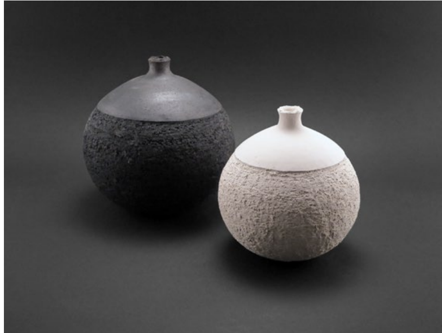
Canal Craze, Darker than Black ( far left ) • Whispering Globes wheel-thrown • naked raku, raku • Ø 13 cm